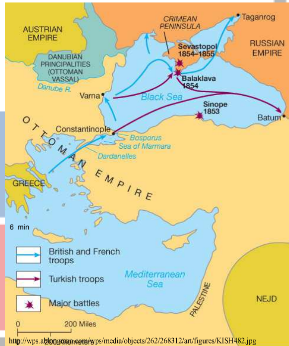
The Crimean War

Russia was defeated by combined forces of Turkey, Britain, France, Piedmont, Austria. It seriously weakened Russia and Austria and illustrated Russia's backwardness.